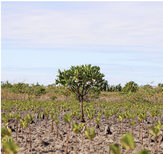
29 May, 2024, 9:21 AM GMT+03:00, Madagascar.