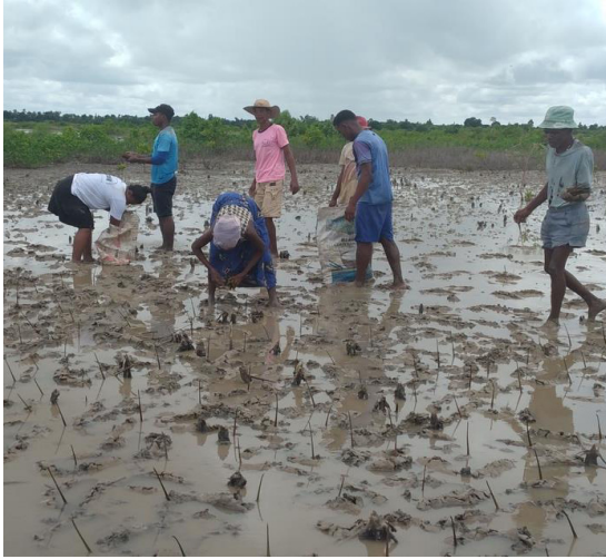
12 January, 2024, 10:39 AM GMT+03:00, Madagascar.