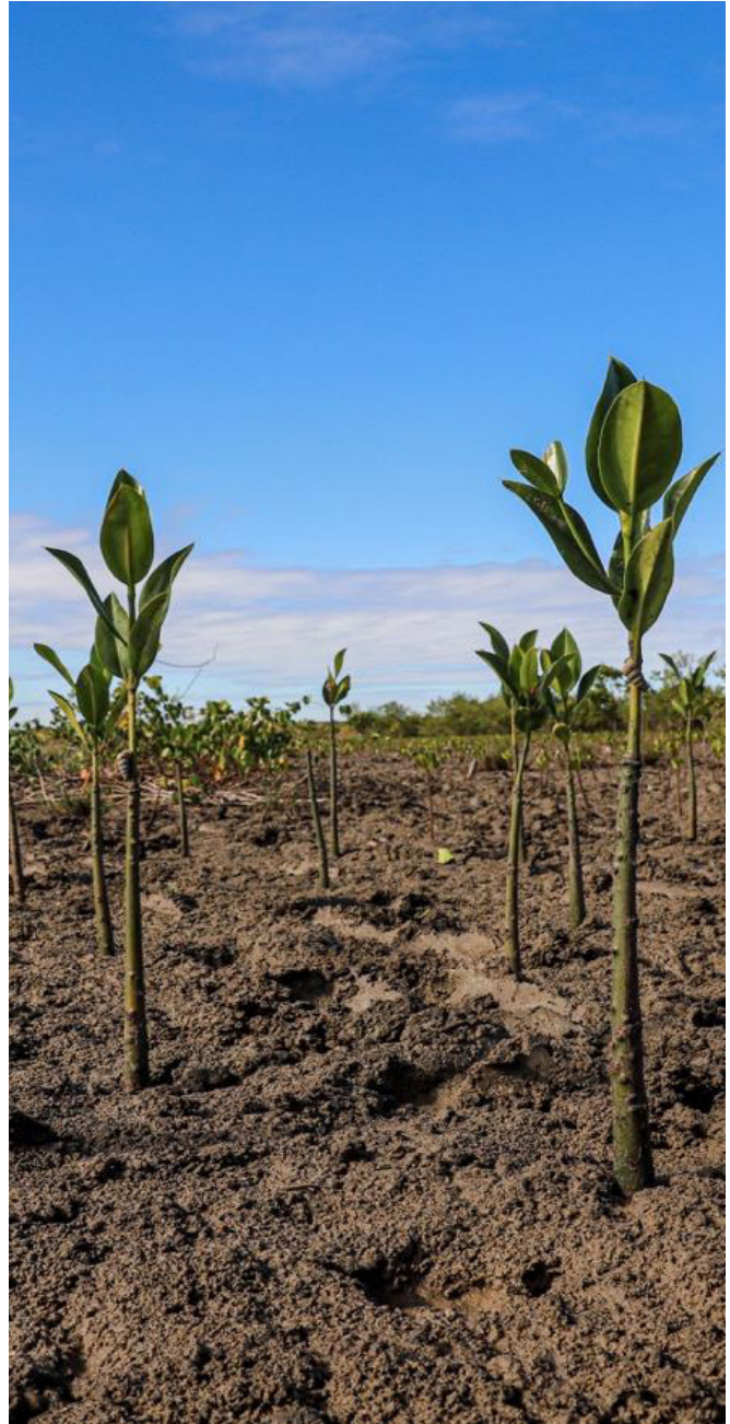
29 May, 2024, 9:31 AM GMT+03:00, Madagascar.